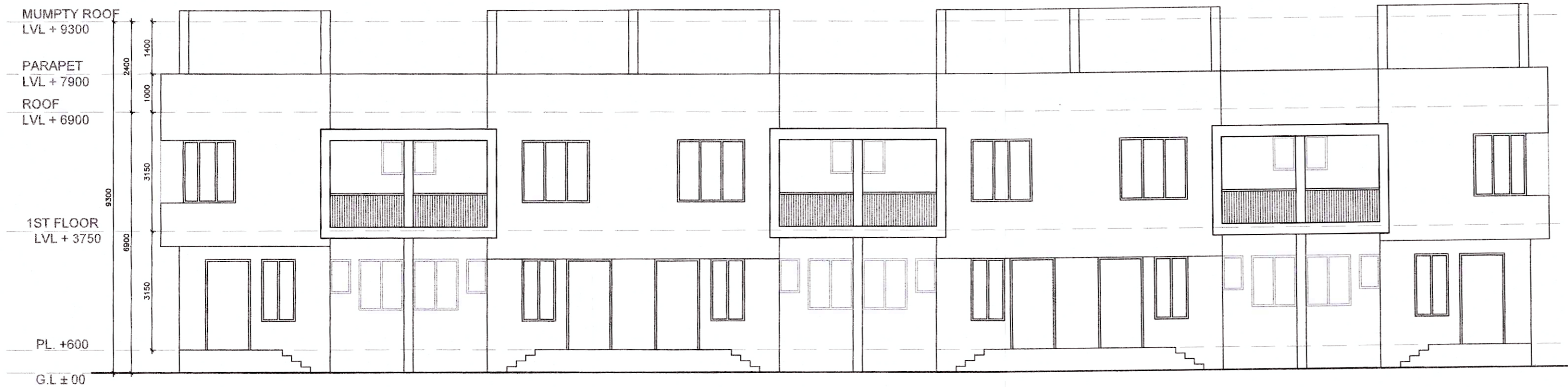
FRONT SIDE ELEVATION SCALE - 1:100